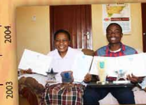
Caleb's mother commended the government for prioritising issues of education.