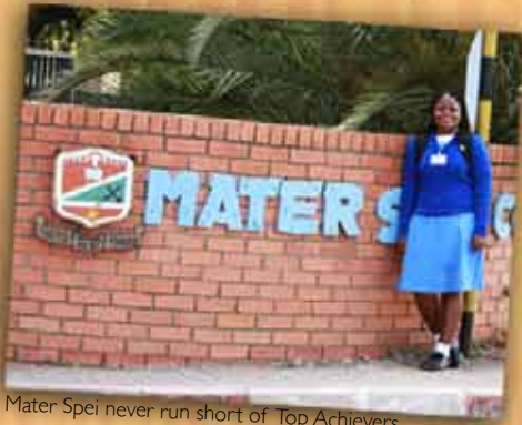
Mater Spei never run short of Top Achievers.