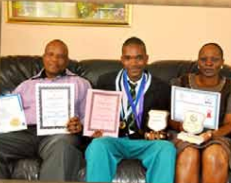
Dikano's parents thank God for shining light onto academic path.