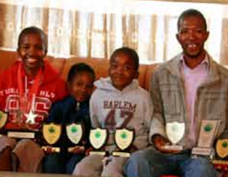
The second time Excellence Award recipient's prizes are too many for the whole family's hands.