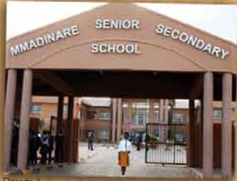
Despite being a relatively new school, Mmadinare Senior made their debut in the Top Achievers' standings.