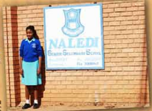
Naledi produced the 2014 Golden star.