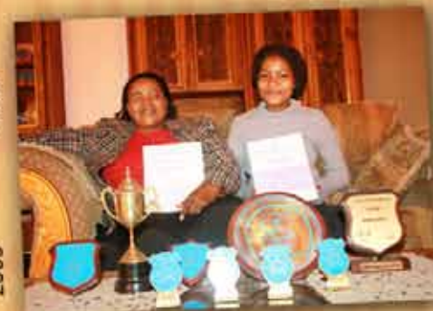
Though she was not passionate about her studies at JCE level she still collected numerous awards.