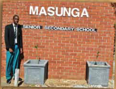
For the second consecutive year Masunga Senior is represented in the Top Achievers charts.