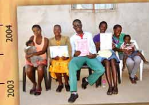
Clement family are happy their book worm has finally reaped the seed of his labour.

2014 2013 2012 2011 2010 2009 2008 2007 2006 2005 2004 2003 2002