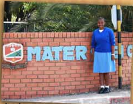
Nonofo gave Mater Spei College bragging rights by walking away with a Ministerial Award.